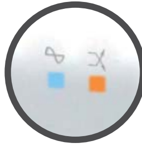
Hidden LED screen.