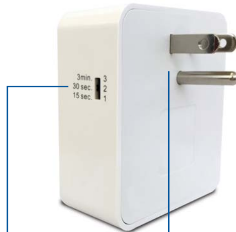
Delay selector (15-30 sec. & 3 min.)